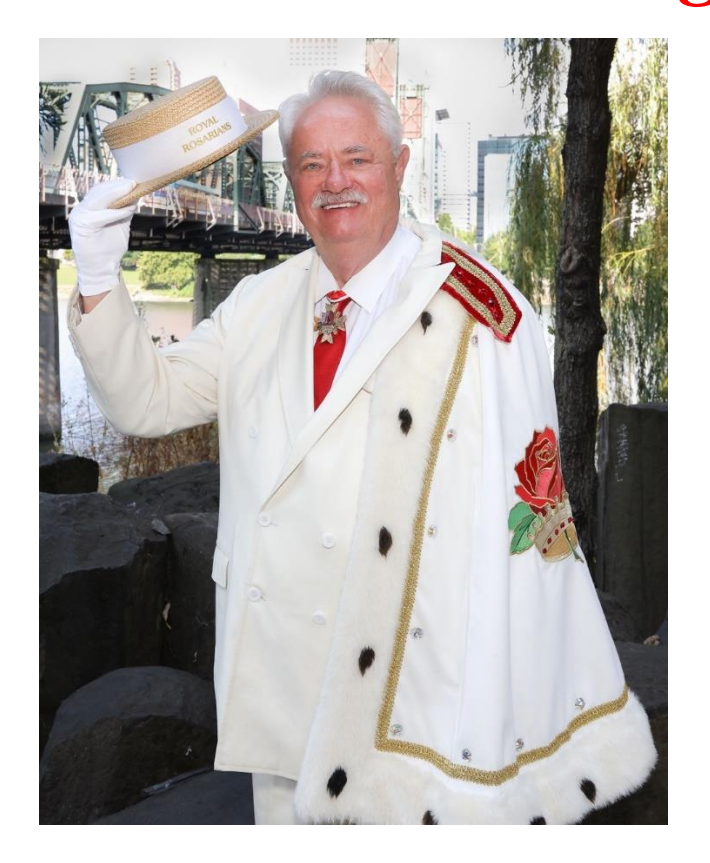
Welcome to the 2023 Rose Festival & Parade Season We invite you to march with us!