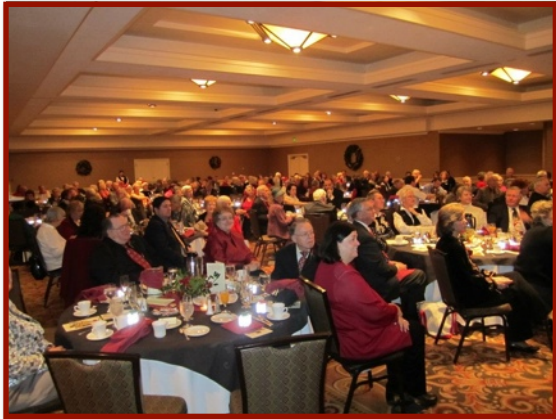
The 2011 Holiday Brunch at the Benson Hotel