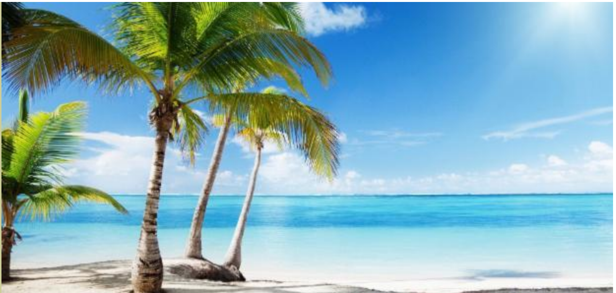
Daydreaming on a dreary winter's day..