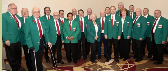
Royal Rosarian Life Members at the November Membership Meeting