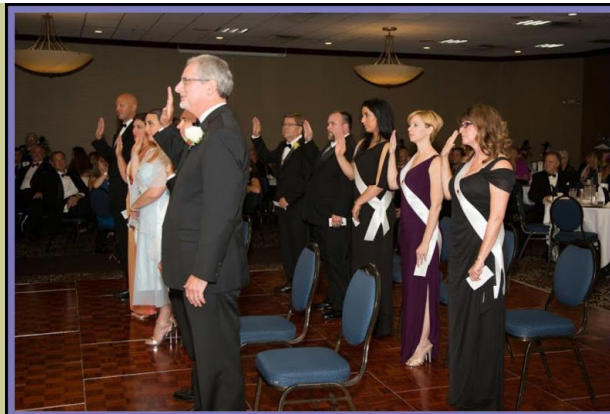
image: the Class of 2014 pledge their commitment to serve the Royal Rosarians in last year's New Member Knighting ceremony at the Holiday Inn in Wilsonville.