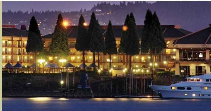
image: this night time view of the elegant Red Lion Hotel at Jantzen Beach is from the Columbia River.

This year the event will be held at the Red Lion Hotel at Jantzen Beach. It is a perfect venue to enjoy the Columbia River and to enjoy your favorite dance music. It will be a formal affair for an evening of royal elegance. Invitations have been sent (this year email is being used for many). The cost is $65.00 per person. Sign up now online.