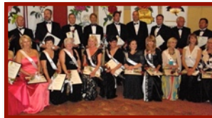
New Member Knighting