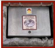
Centennial photo and placement of the time capsule at Washington Park